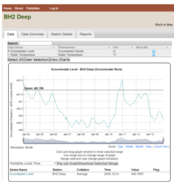
Example screen shot of the web database

There are six main groundwater monitoring sites in four states. The sites have been selected to cover the range of climate zones and aquifer properties experienced in Australia. Further details of each site are overleaf.